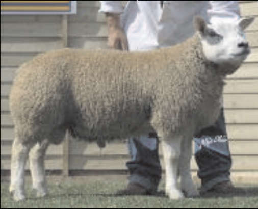
Top price male 2010 Hillcrest Rocket Man Sold for €2300gns