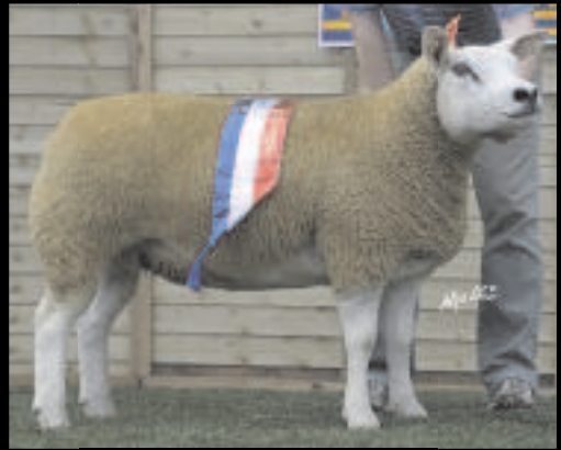
Top price female 2010 PNI 09075 Sold for €2000gns

Blessington Mart, Co. Wicklow SHOW- Friday 12th August at 3.00pm SALE- Saturday 13th August at 11.00am