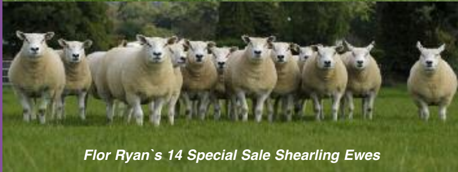
Flor Ryan`s 14 Special Sale Shearling Ewes