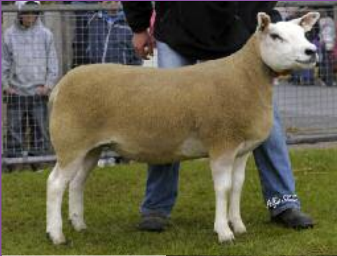
◀ 1st Prize Gimmer R.U.A.S. by Nijinsky, twin to 0823 (Lot 80).