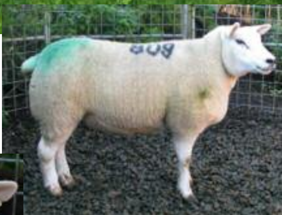
▲ Lot 16, CQI 08009