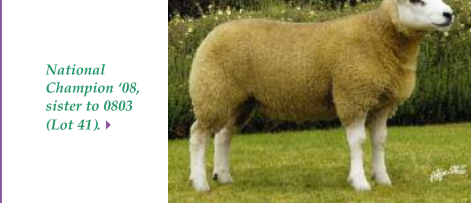
National Champion '08, sister to 0803 (Lot 41). ▶