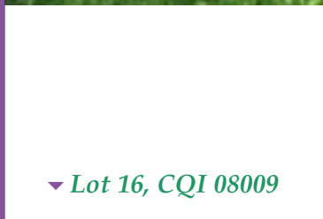
▼ Lot 16, CQI 08009