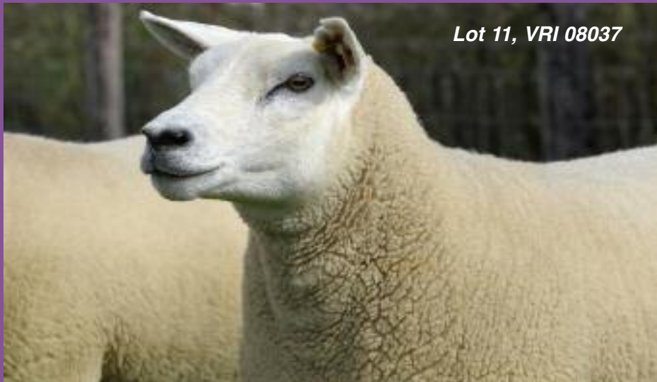
Lot 11, VRI 08037