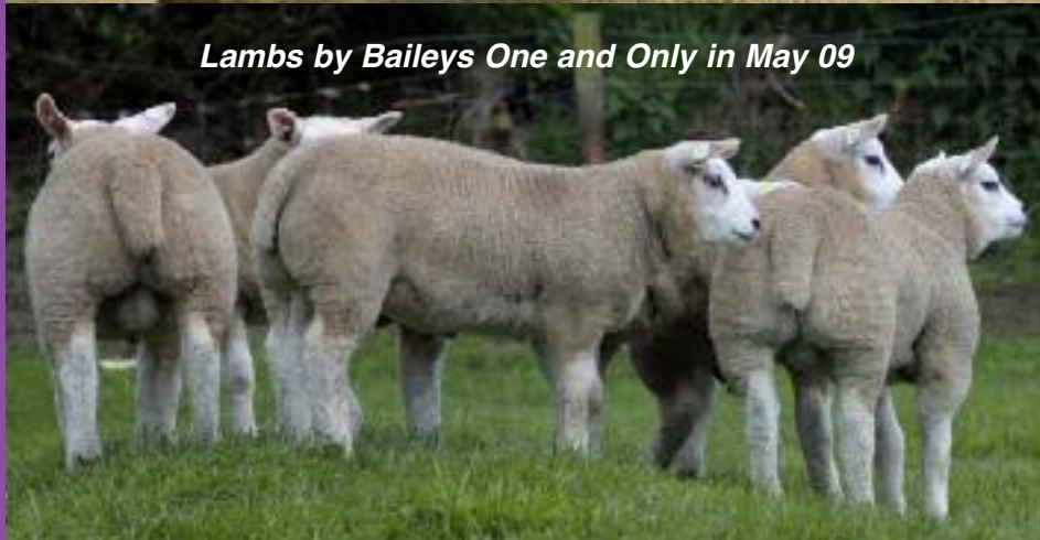
Lambs by Baileys One and Only in May 09