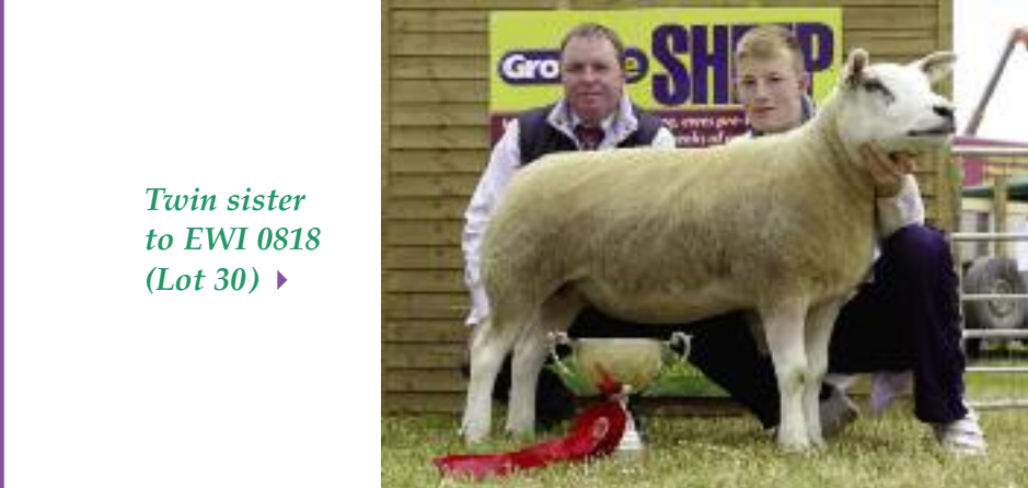
Twin sister to EWI 0818 (Lot 30) ▶