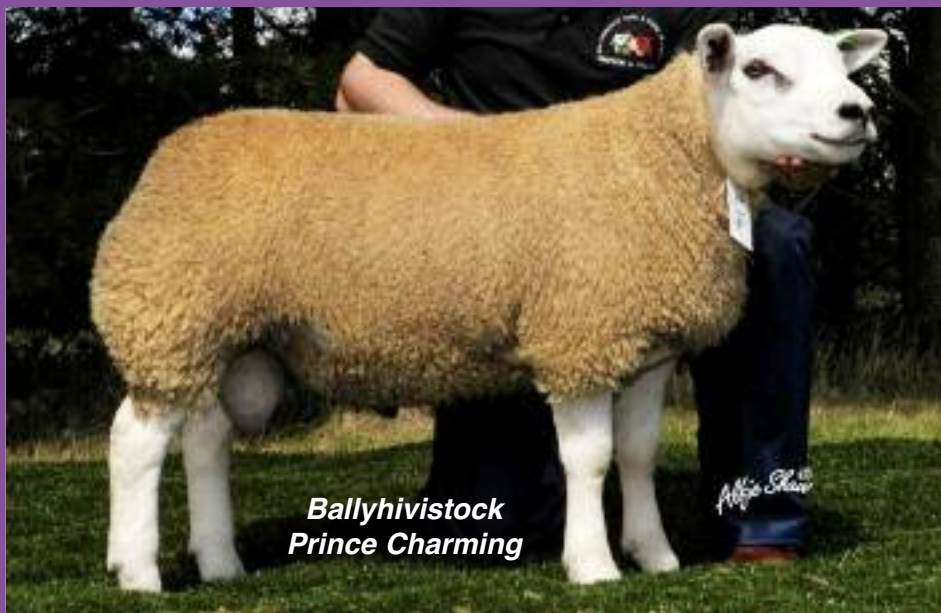
Ballyhivistock Prince Charming