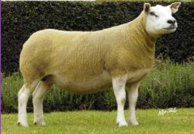
◀ Dam of 0819 (Lot 81).