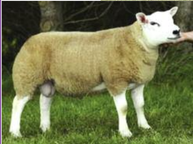
◀ Castlescreen OJ