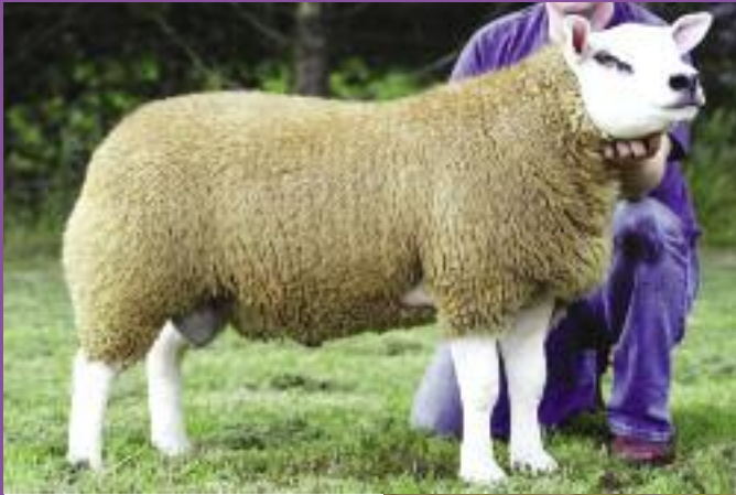
◀ Tullagh Neptune