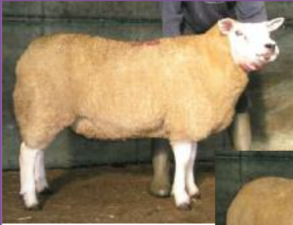
◀ Lot 1, PNI 08036.