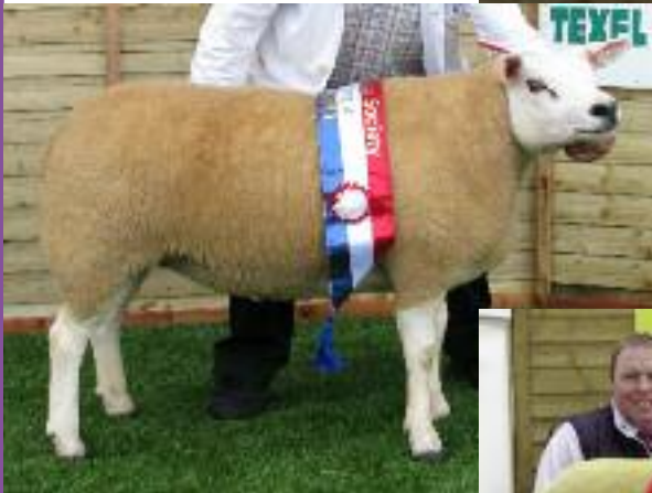
National Champion '09, PNI 08016. She's by Tullagh Neptune and sold for €10,000 to Proctor Farms, England. ▶