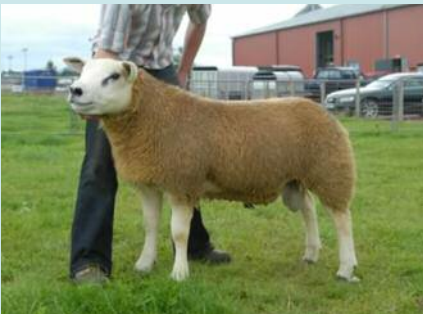
Clougher Preident - 3rd highest priced ram Lanark 2009, at £14,000gns