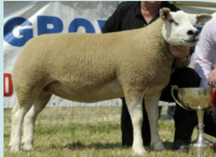
Daughter - 2010 all ireland champion