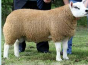
Neptune as lamb in 2007 Dungannon (Champion Premier Sale Champion)