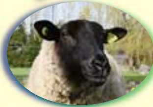
Slaughter & Mart Tag