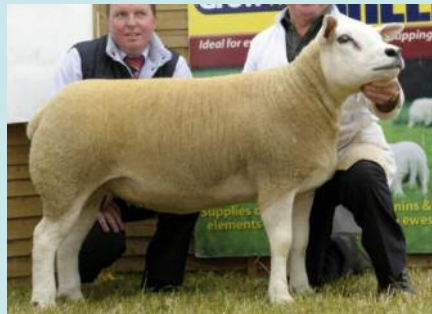
Daughter of Neptune - 2009 All Ireland Champion sold for €10,000