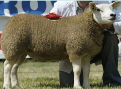
Daughter - 1st prize novice ewe lamb 2010 All Ireland