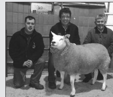
Highest priced ewe at last year's sale, sold to S. Murray, Donegal, 1,050gns

2nd annual sale of in-lamb shearling ewes from the following six flocks: