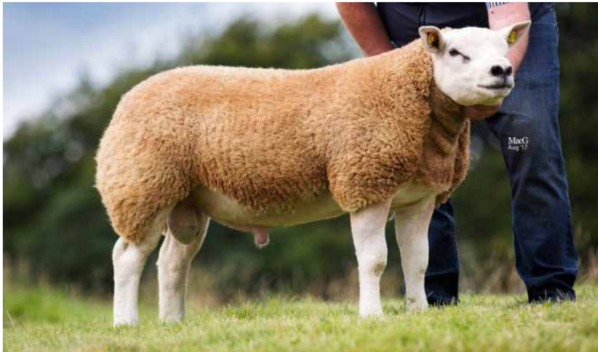
Service Sire Knockbrandon Allegiance

The Grove Texel flock was established in 1989,our sheep are run on a commercial bases along with our xbred flock and are recorded with Sheep Ireland .this year we had the North Eastern Champion Texel at Oldcastle Show with our show ewe Grove Yasmin.Our 6 shearling ewes for the Sale are by the same sire or same grand sire as Yasmin and all are in lamb to Knockbrandon Allegiance who was 6 place in the novice class in Blessington premier sale this year.