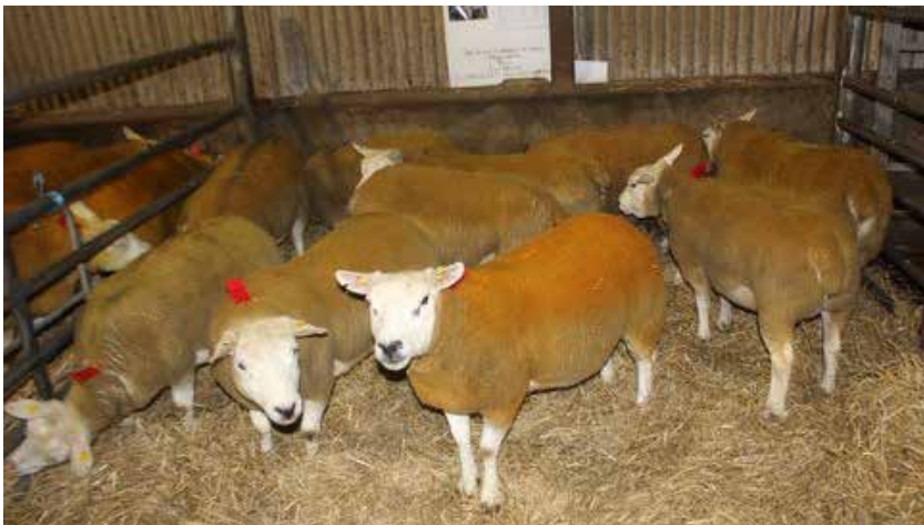
Ewes from the Macetown Flock in the sale