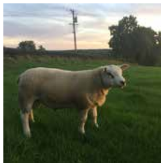
Sire by Yogi Bear