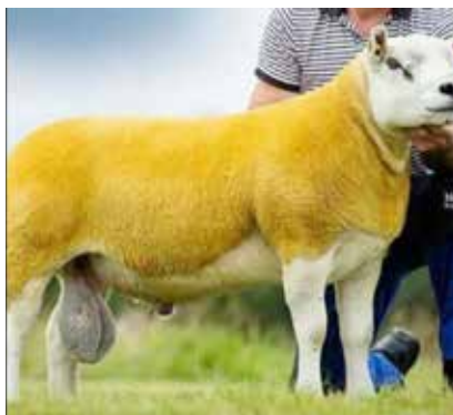
Oberstown YSGAWYN. First prize shearling ram at Blessington, full sister is Lot No. 31