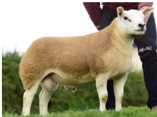
Picture above is Springhill Attraction son of our top price ewe from this sale last year. Springhill Attraction was retained for breeding in the Springhill flock.

All our ewes are on the Heptovac P System and vaccinated with Enzovax and Toxovax.