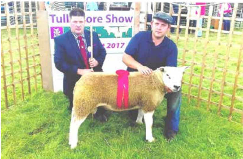
Thornville Ace – Winner at Tullamore Show 2017

UV11701326 – Thornville Ace geno type 1. Sired by Tophill Wall Street who is also sire of the Male Champion of The Irish Texel Premier Sale 2017 which was sold for €17,000. Thornville Ace was placed 1st in Tullamore Show 2017 and 2nd prize in the Ram Lamb class in The Irish Texel Premier Sale 2017. He is a full brother to the 2017 All Ireland Champion and maternal brother to Thronville Wilson which is also sired by Tophill Wall Street.